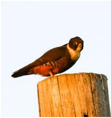
Bat Falcon – 1 st U.S. Record