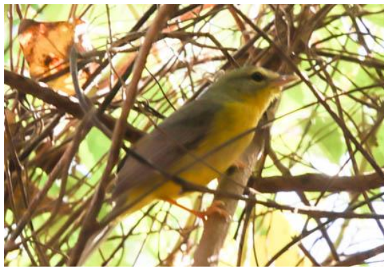
Golden-crowned Warbler - Rare