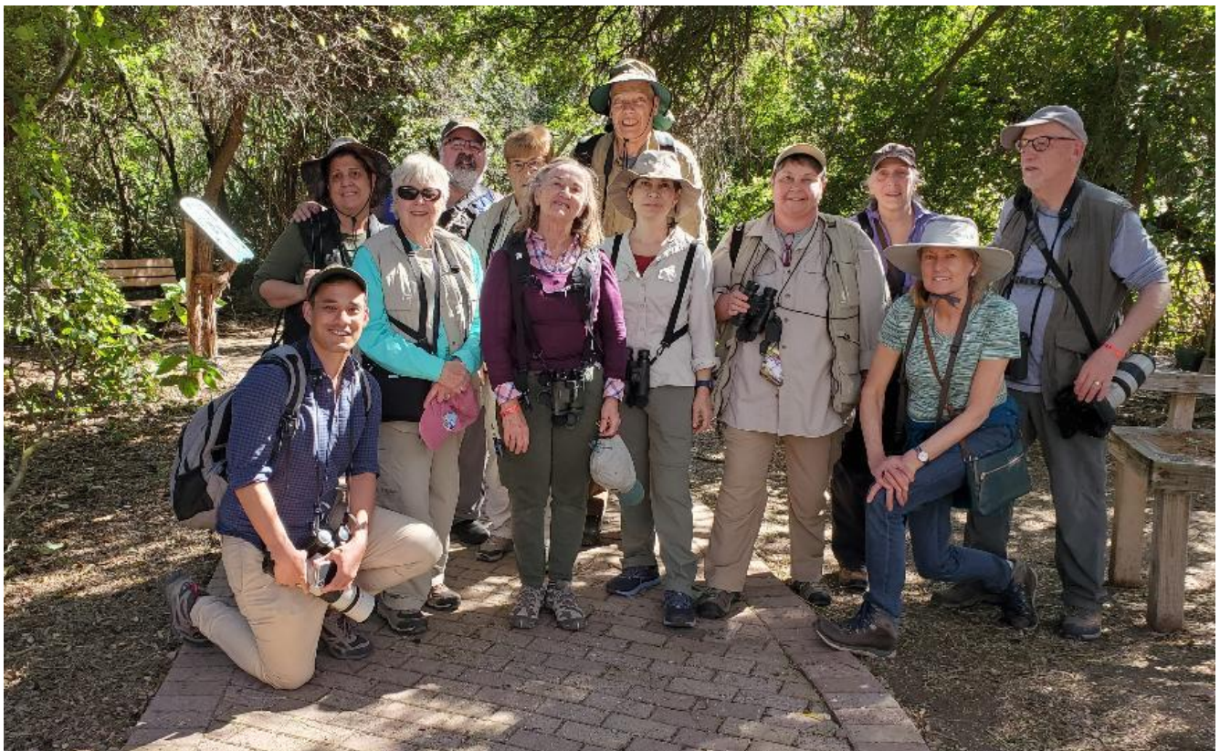
Photo: Our intrepid group of happy birders after seeing Golden-crowned Warbler!