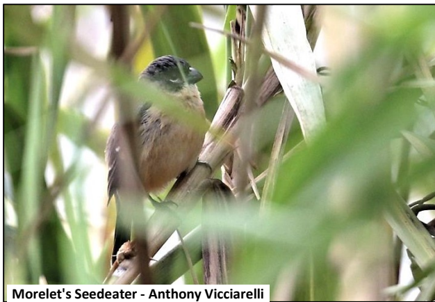
Morelet's Seedeater - Anthony Vicciarelli

Here, a beautiful Black-throated Sparrow was kind enough to perch in a bush beside the parking lot. Another stunner!