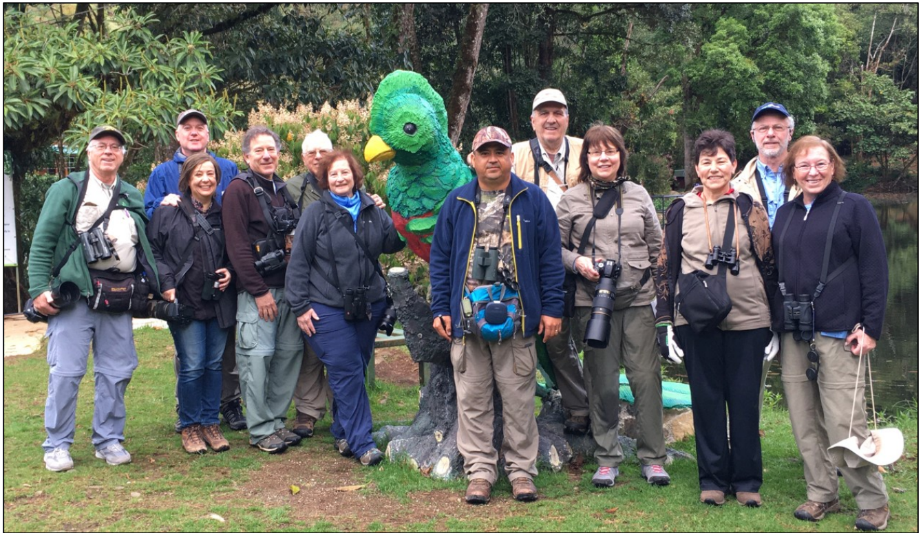
Photos: Talamanca Hummingbird, Sunbittern, Resplendent Quetzal, Congenial Group!