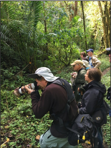
Sunrise Birders on the trail