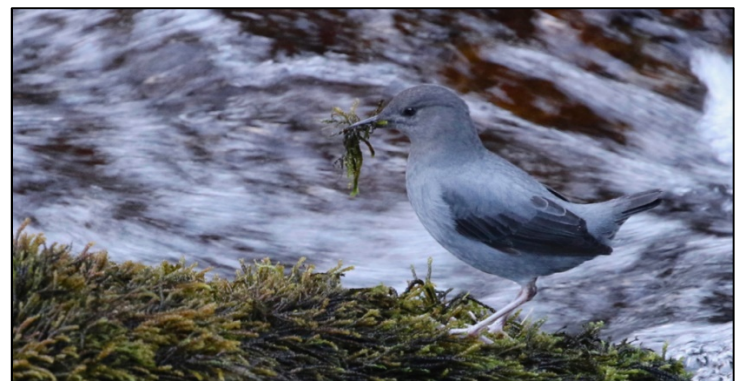
Photos: Collared Whitestart, Golden-browed Chlorophonia, Resplendent Quetzal, Snowcap, American Dipper.