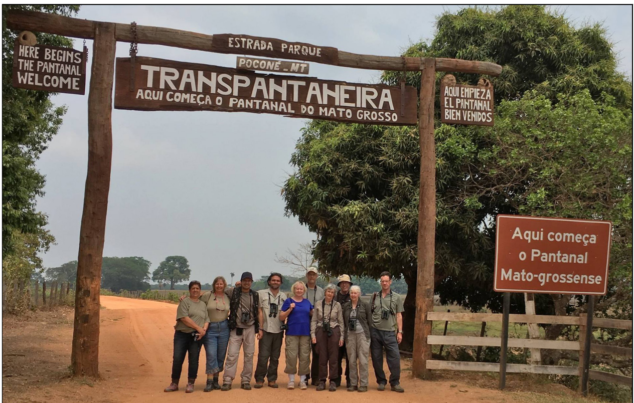
Photos: Coal-crested Finch, Helmeted Manakin, Black-girdled Barbet, Group at Transpantaneira