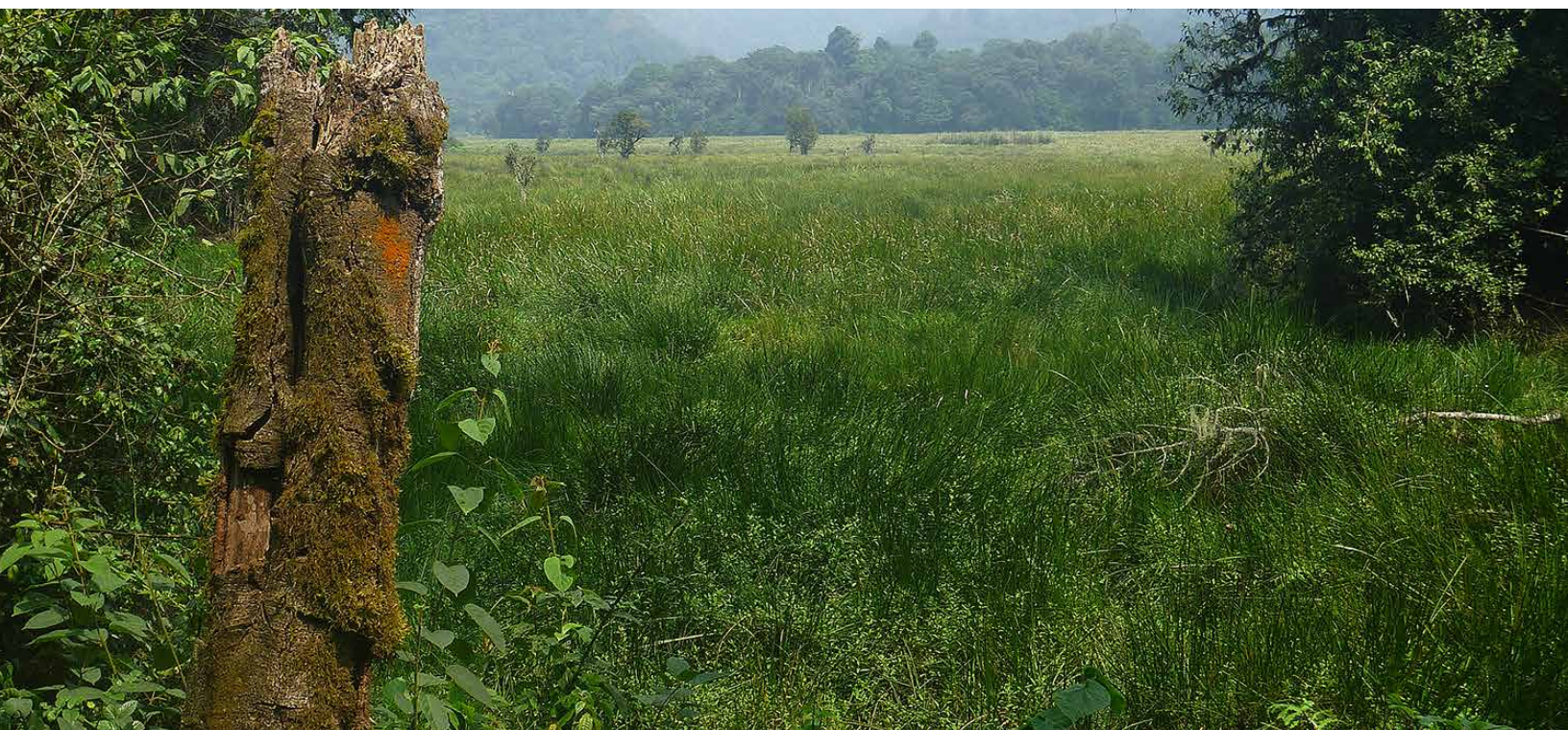
Mbwindi Swamp - a swamp in the middle of a jungle valley!

We returned finally to the road, tired but blown away by the quality of birding – definitely one of the best day's birding of the trip!