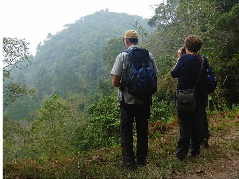
Birding the lush jungle at Rubija