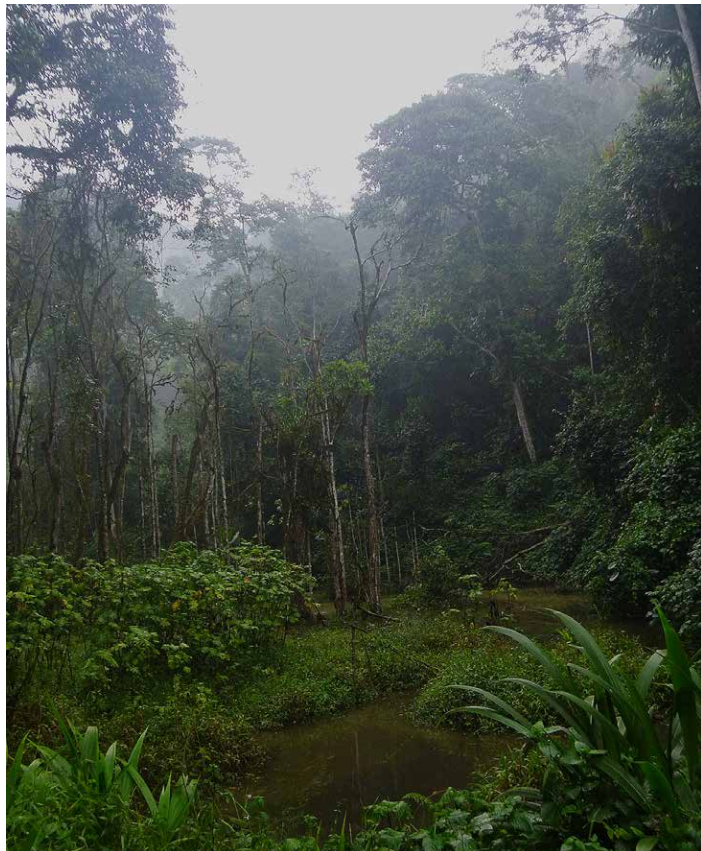
Mountain habitat en route to Ruhija

Mountains of Ruhija from our cabin at the Gorilla Mist Camp