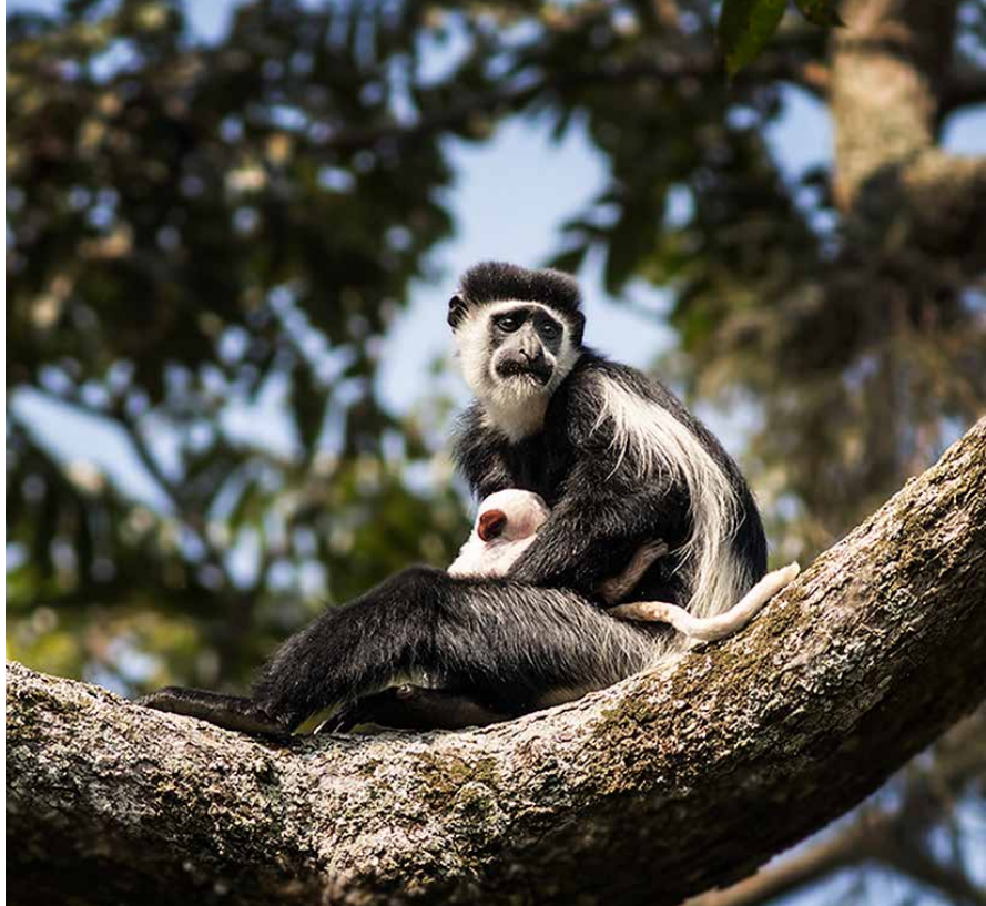
Black and White Colubus Monkey with baby

Beers and a comfortable bed welcomed us and sleep came quickly that night.