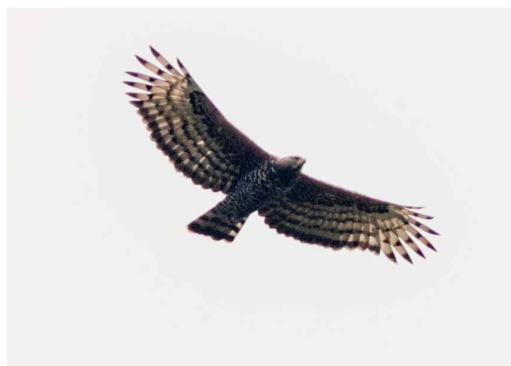
A stunning Crowned Eagle circling overhead