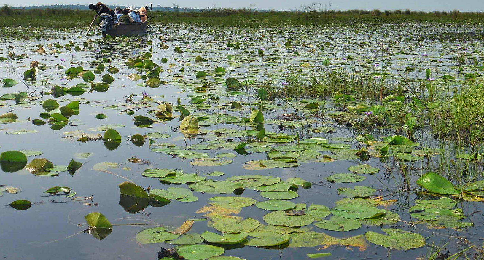
Mabamba Swamp –home to Shoebill, Lesser Jacana and other goodies!

We were all shell-shocked to come around a corner and basically come face to face with a Shoebill sitting quietly in the marsh. We drifted slowly to within 20ft of this monstrous duck-eating heron. We were so close I could barely fit it in the camera frame. Several minutes ensued of pixels being burnt as the group enjoyed the first of many amazing bird experiences. The first morning and one of Uganda's enigmatic birds was already under the belt!