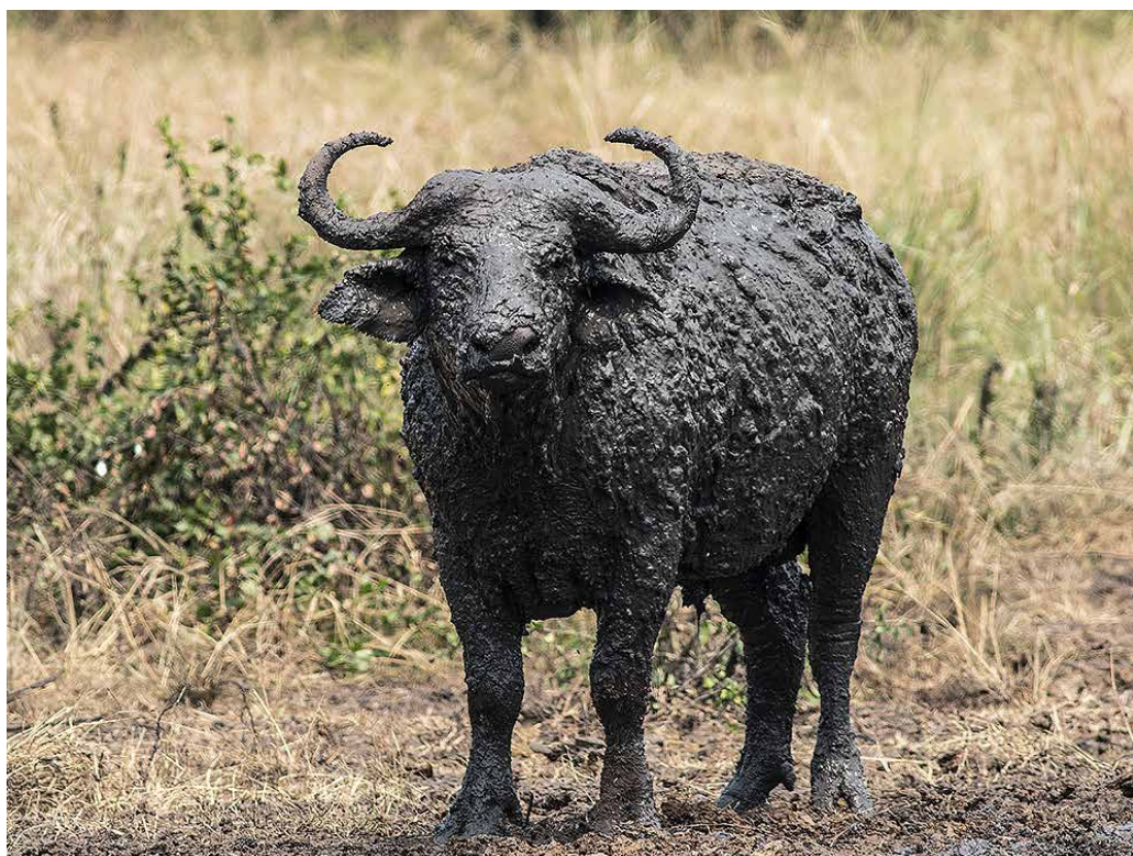
There's a Cape Buffalo under there~