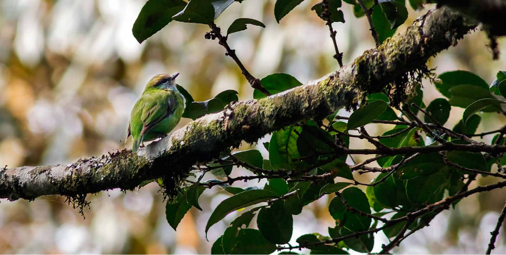
One of two diminutive megas -African Green Broadbill!

We headed back up the track, skirting the marsh and as we got to an open area, Robert or Amos spotted a Grauer's Rush Warbler sitting out in the open vegetation and giving amazing views. BOOM! On the list.