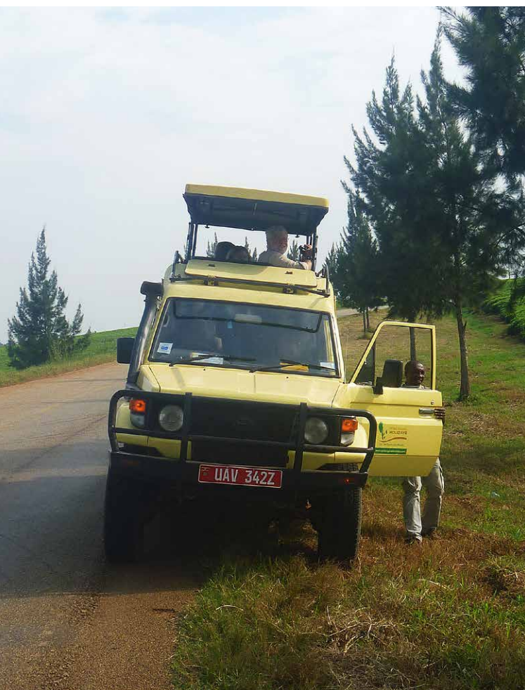
Top up, not down--now we are really in Safari mode