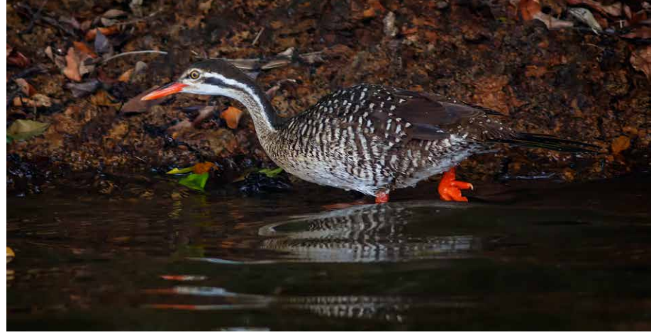
Could African Finfoot be any easier?!