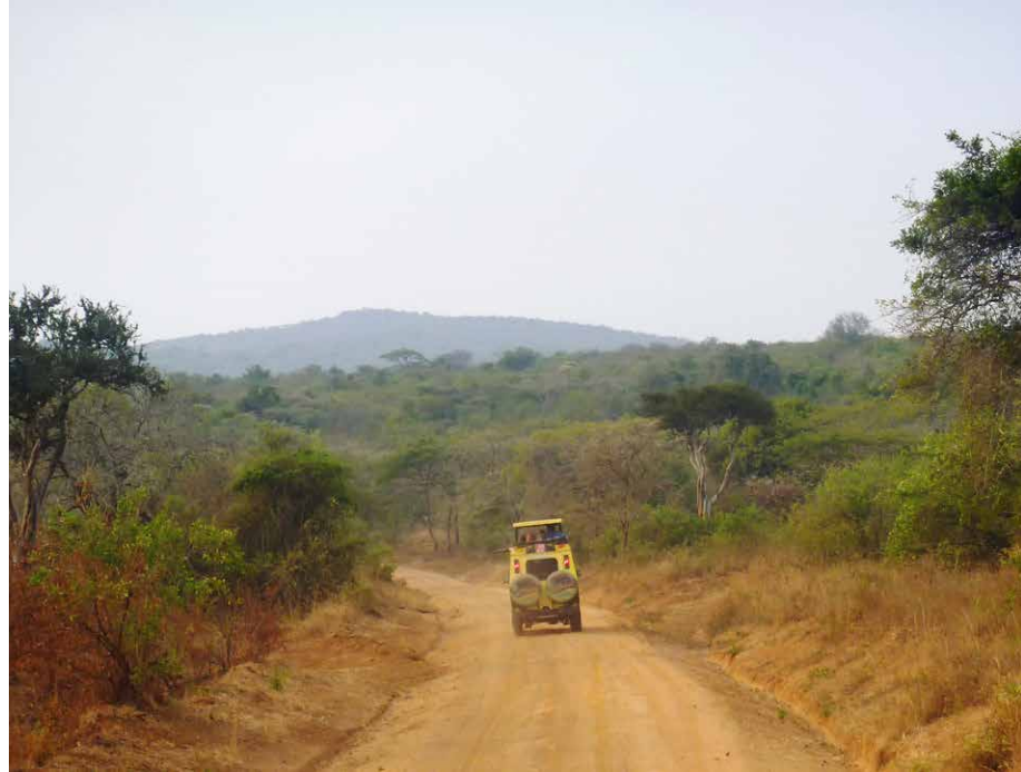
Looking for 'big' game at Mburu

It was nice to finally reach Lake Mburu, albeit with a bit of anxiety knowing we had a boat to catch – and that was our only chance of two major target birds – White-backed Night heron and African Finfoot. After stopping to tick off some of our first big game such as Zebra, Waterbuck, Impala and Bushbuck, we sped to the dock, noting many more Bateleurs, and Ruppell's Griffon Vultures overhead.