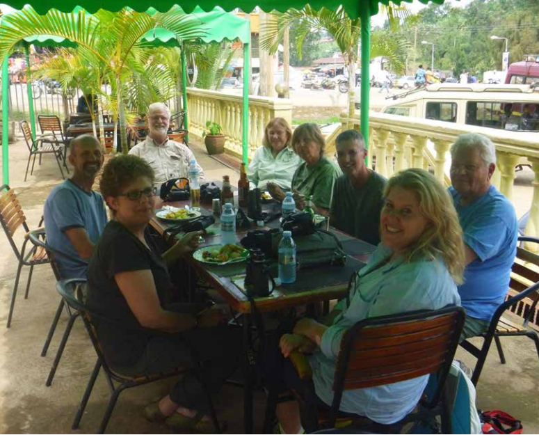
The crew doing what they do best!