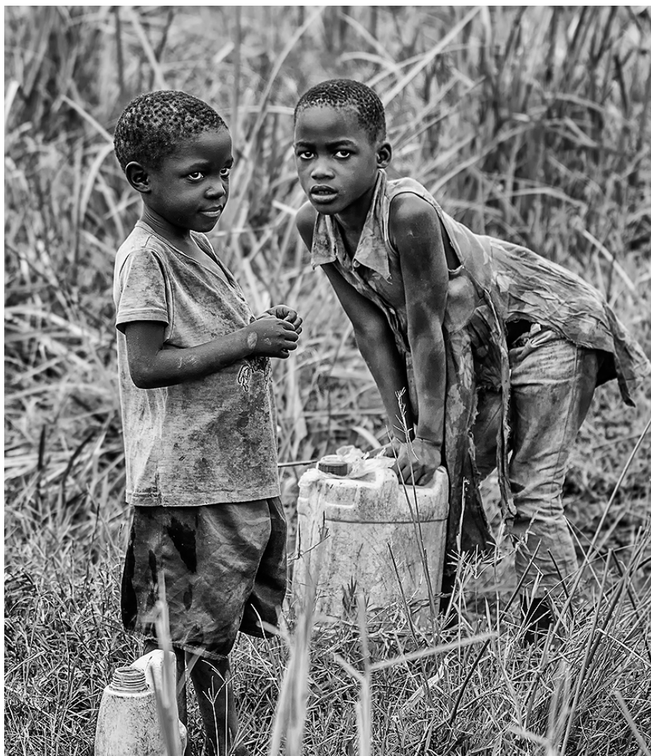
Local kids gathering water to take up to their village

Quickly we were back to Entebbe Airport with time to check-in and eat some lunch. As we pushed our luggage up the ramp, we were waved off by eye-level aerobatics of Little Swifts. We said our goodbyes to Brian and other members of the group, and reflected on what a spectacular and enjoyable trip it had been. With over 320 species of bird and a host of mammals it had been a great group of people and an overwhelming success on all fronts!