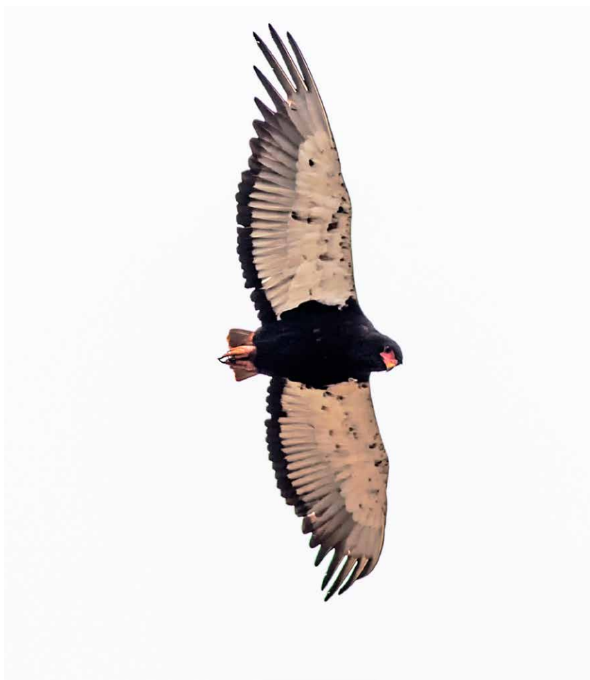
Bateleur – definitely a cool raptor!