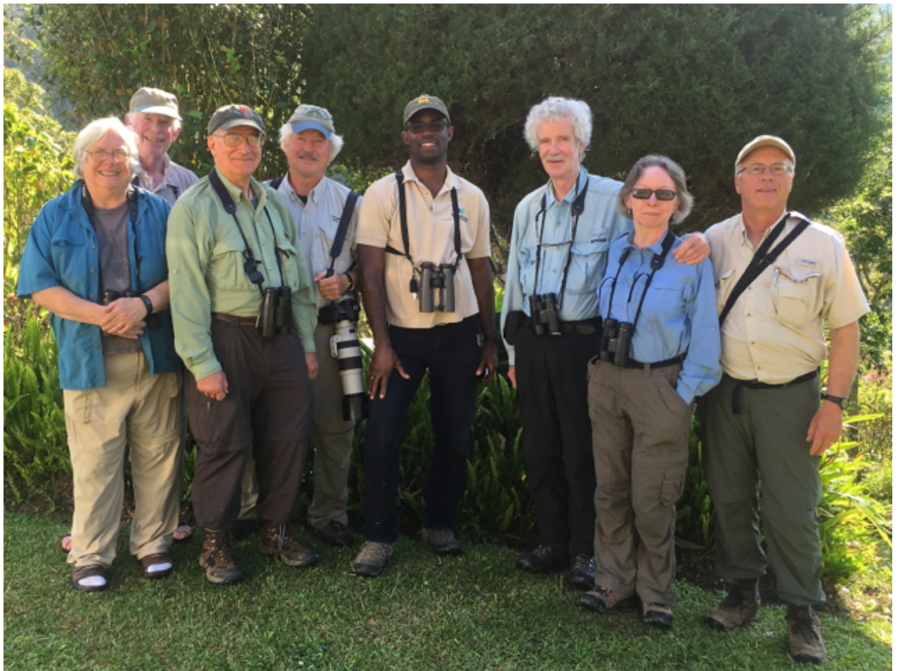
Photos, top to bottom: Jamaican Spindalis, Jamaican Tody, Crested Quail Dove, happy group!