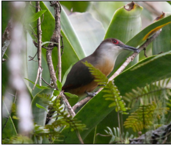
Jamaican Lizard Cuckoo