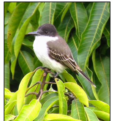
Photos: Black-billed x Yellow-billed Parrot, Zenaida Dove, Loggerhead Kingbird.

Sunrise Birding LLC USA 203 453-6724 gina@sunrisebirding.com