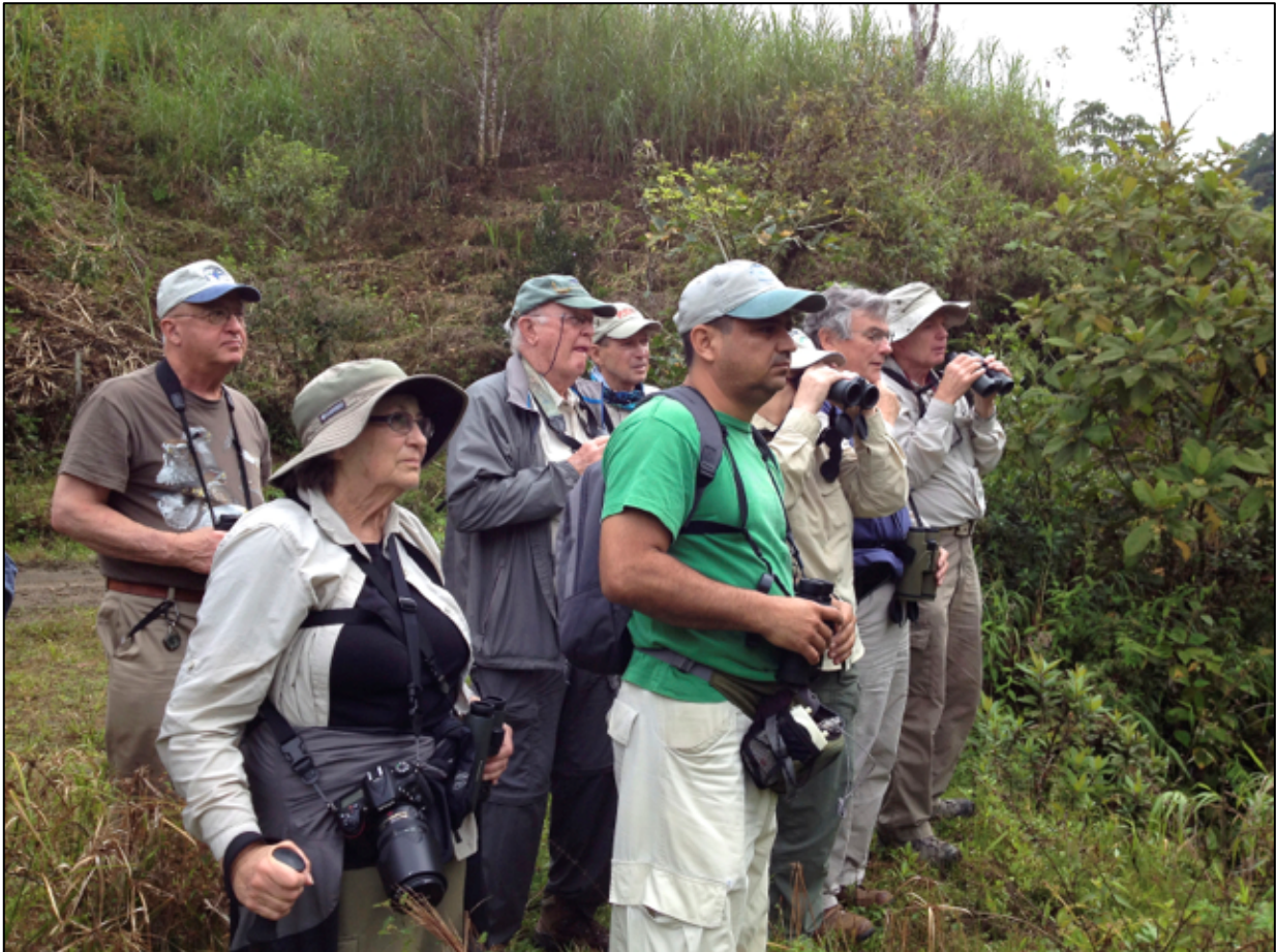
Birders at El Silencio

Following a hearty breakfast, we loaded the van for a morning excursion to bird a side road in Platanillo/San Antonio that climbs up Silence Mountain (El Silencio). Birds were plentiful along the riparian and forested slopes: Variable Seedeaters, White-tipped Dove, Tropical Pewee, Paltry and Torrent Tyrannulets, Emerald and Tawny-crested Tanagers, Tropical Parula, Lesser Greenlet, and Slate-throated Redstart . At least one Giant Cowbird was spotted by Vernon among the active Chestnut-headed Oropendola nest colony. Walking back down the road, we saw Carmioli's (Olive) Tanager, Buff-rumped Warbler, Black-headed Saltator, Social and Gray-capped Flycatchers , female White-ruffed Manakin , and Black-and-Yellow Tanager . Ron spotted a Rufous Mourner which allowed nice scope views. We heard then had great views of a pair of calling Sunbitterns down along the river. Definitely a highlight of the trip! A perched Broad-winged Hawk was seen and then Frank got a Band-tailed Pigeon in the scope. All were delighted with views of a male Green Kingfisher near a bridge, viewed from the van.