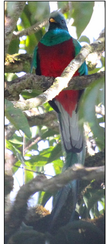
Photos: Silver-throated Tanager, Snowcap, Black-and-yellow Silky Flycatcher, Scintillant Hummingbird, Resplendent Quetzal