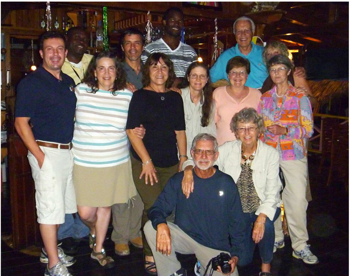
Photos: Jamaican Oriole, Black-throated Blue Warbler, Vervain Hummingbird, Jamaica 28 Club.