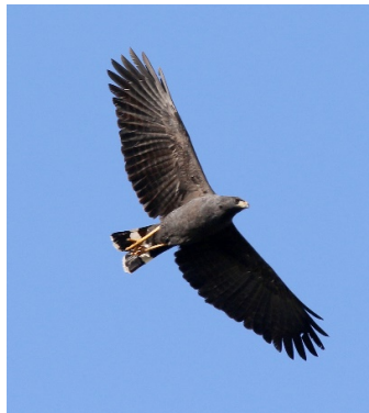
Great Black Hawk