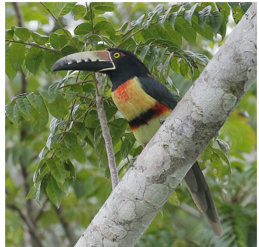
Collared Aracari