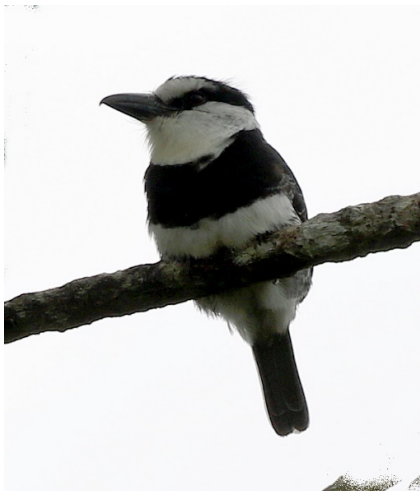
White-necked Puffbird (Steve Bird)