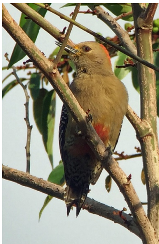
Yucatan Woodpecker (Steve Bird)