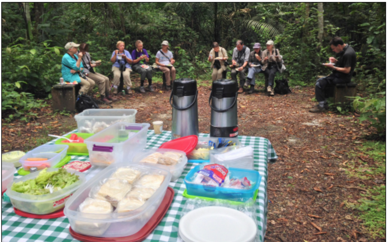
Picnic Lunch at Pipeline Road

September 6 - Today we spent almost all day long on the famous Pipeline Road! We started with Scarlet-rumped Caciques, Purple-throated Fruitcrows, Chestnut-mandibled Toucan, Black-breasted Puffbird, Blue-headed Parrot, a pair of Forest Elaenias nesting, Purple-crowned Fairy, the not so common Hook-billed Kite, and a lifer for me: Scaly-throated Leaf-tosser at a very busy spot near the parking lot at the entrance of the road. We kept walking along the road and found a lovely couple of Great Jacamars, Slaty-tailed and White-tailed Trogons, Rufous Motmot, a Fasciated Antshrike couple feeding a young, and some superbly displaying Red-capped Manakins. One of the coolest attractions of the day was when Lynda and Charly our driver found us a Tiny Hawk (61.5 to 75g, and 23 cm) with a big prey hanging from its talons. The prey looked like a Black-breasted Puffbird (60 to 69g, and 22cm) almost bigger/heavier than the hawk; this was the trans-Andean fontanieri subspecies that only occurs in Central America and Caribbean Colombia, and named after V. H. Fontanier, a French collector in Colombia in 1850.