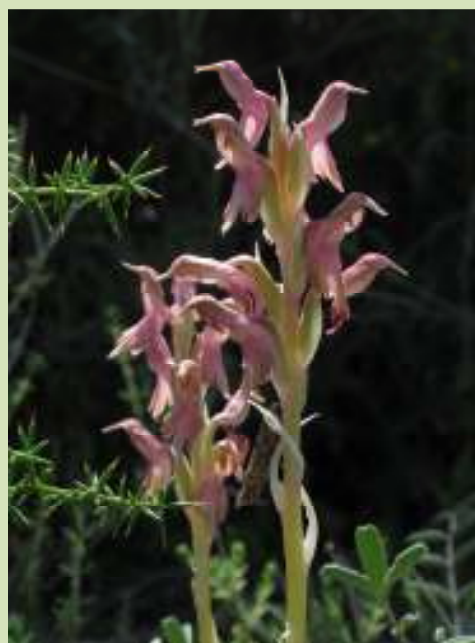
These Holy Orchids were found near the beach