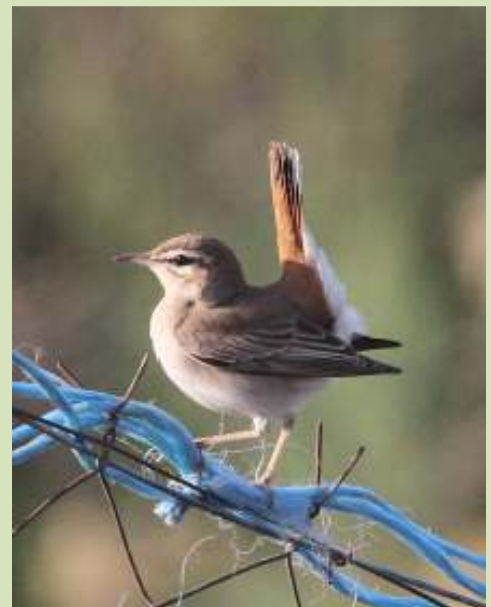
One of three superb Rufous Bush Robins seen together near the Tsiknias River

The magical island of Lesvos lived up to its name once again. This year's unseasonal good weather was an excellent break from the harsh British and US weather but meant there were fewer birds than normal for this time of year. We did however see most of our target birds and of course many sought after migrants that readily pass through this beautiful island. Add to this rare butterflies, dragonflies, orchids and flowers then it's no wonder people come back time and time again. Our tour was once again timed to get a good variety of the spring migrants that are heading north from their wintering grounds. We were not disappointed and enjoyed superb views of most of the birds we saw. The two star birds, Krüper's Nuthatch and Cinereous Bunting were easily seen, and a wealth of other sought after species duly obliged. Of special note was the four Rufous-tailed Robins we found with three sat next to each other on a fence! Three Scops-Owls in one spot and a Long-eared Owl with chicks was a delight as was the evening light and ever changing birds around the salt-pans, all adding wonderful memories to this wonderful holiday. As ever the tour was enriched by the camaraderie of many of our fellow birders. We will return again next year to see what wonderful surprises await us. Zoothera currently offer the very best price for their inclusive tour to this fabulous Greek Island.