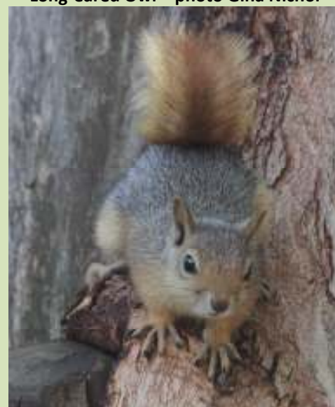
A cute looking Persian Squirrel