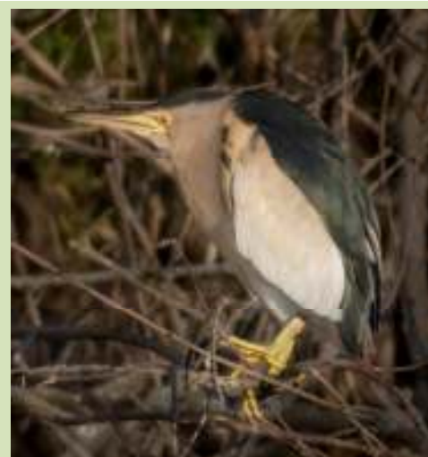
Little Bitterns were easy to see and we had as many as 10 in one place

Today we checked the Tsiknias (West) River before breakfast getting good views of a singing Nightingale , a