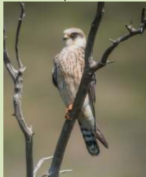
This perched Red-footed Falcon posed wonderfully for us – Vaughan Ryall