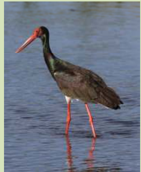
A great year for Black Storks which showed well to us on many occasions