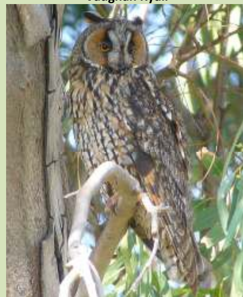
What great views we got of this adult Long-eared Owl