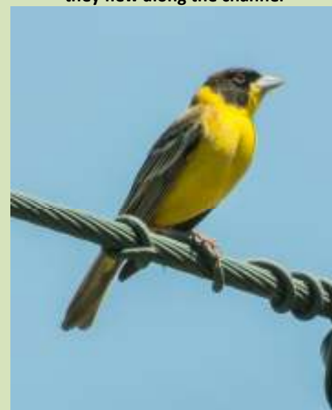
The song of the Black-headed Bunting could be heard throughout the island