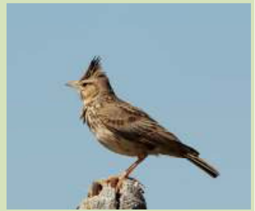
One of the commoner birds on the island we saw Crested larks everyday

This morning before breakfast we made a visit to Metochi Lake (Inland Lake). It's always best to visit early morning and we were not disappointed as we found at least 10 Little Bitterns , 4 Little Crakes , Red-rumped Swallows , Little Grebe , 12 or more Black-crowned Night Herons , Squacco Herons , several Sedge Warblers , and a couple of Great Reed Warblers that showed well. After a while, one