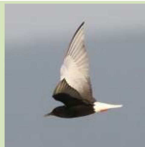
Great views of White-winged Terns as they flew along the channel

A number of Great and Little Egrets were seen along the way as well as a Grey Heron . A stop just past Achladeri Forest found us a Serin at the top of an evergreen and some European Greenfinches . We made our way into an olive tree plantation and had varying views of an Olive Tree Warbler that was nesting in one of the groves. A Black-billed Magpie made a very brief appearance in another tree but otherwise the olive grove was quiet. On the way out we had two female and two male Red-footed Falcons perched on some power lines showing very nicely. At the salt pans we had nice views of Curlew Sandpipers , Little Stints and Ruff and then we continued on toward the coastal village of Vatera. A tavern lunch overlooking the sea in Vatera had us looking at some very active Bottle-nosed Dolphins and several groups of Yelkouan Shearwaters flying just off shore. After lunch we moved up along the coast and found a couple of Sardinian Warblers and an Eastern Olivaceous Warbler that showed well for us. A couple of nice Holy Orchids were a good find. Heading back through the Polichnitos Salt pans we had good looks at the waders again and then we returned to the Kalloni Salt Pans to bird in the fantastic afternoon light. The light was indeed glorious and the salt pans were full of birds including several gorgeous Curlew Sandpipers , more than a dozen Black-tailed Godwits , many Ruff , Little Stints , two Spotted