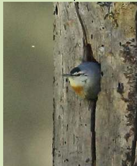
The best place in the world to see the special Krüper's Nuthatch and we were not disappointed