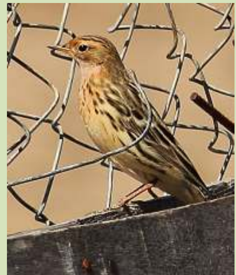
A group of Red-throated Pipits look fantastic in their brick red breeding plumage