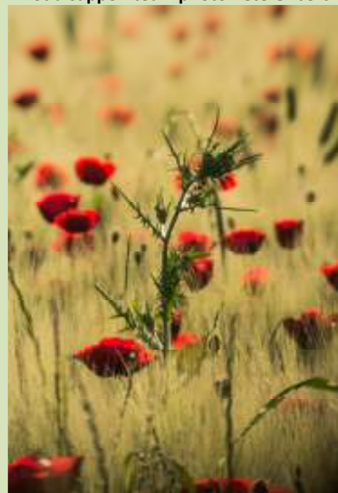
A beautiful photo of Poppies in a Barley field