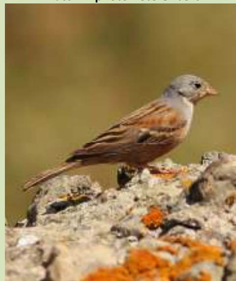
The common Cretzschmar's Bunting was seen a lot