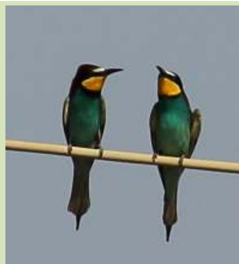
These Bee-eaters were a pleasure to watch

Moving on to a fig orchards we had several Spotted Flycatchers , Pied Flycatcher and a Collared Flycatcher that got away. Two Lesser Grey Shrikes were seen well and there was another Sombre Tit and an unusually pale headed Short-toed Eagle . We stopped for a quick ice cream break in Sigri and then headed toward the ford stopping to see a perched Red-footed falcon . Here there were also Lesser Kestrels overhead and a flock of 40+ European Bee-eaters perched and flying around a large tree. Down by the ford were Wood Sandpipers , a Ruff , a Temminck's Stint and some more perched European Bee-eaters . Pleased with our discoveries here, we drove