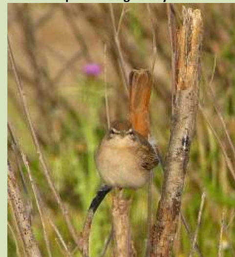
One of three Rufous Bush Robins seen together by the Tsiknias River