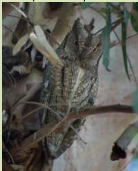
One of the Scops Owls that showed well to us