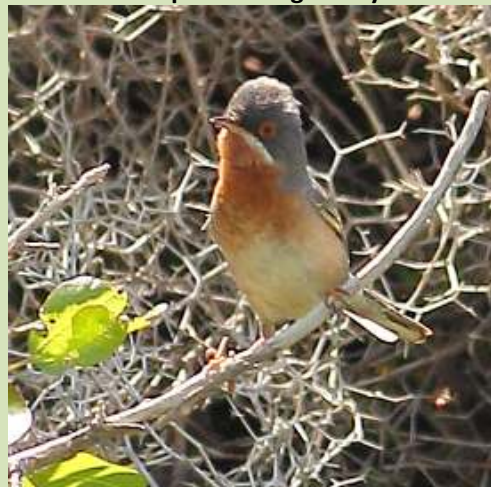
Subalpine Warbler by Pete Gilbert