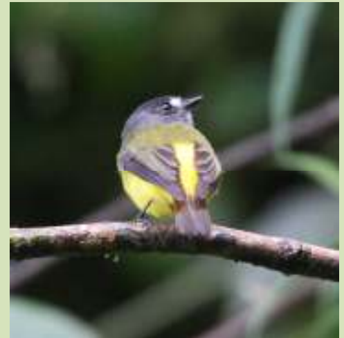
Several gorgeous little Ornate Flycatchers gave great views on Galapagos road