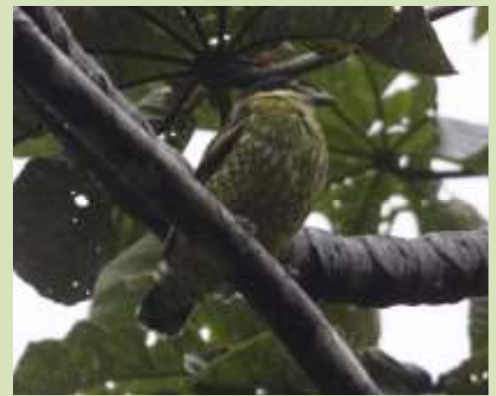
What a surprise this was, a pair of Scaled Fruiteaters that gave superb views on Galapagos road, an area where they are seldom ever seen

This morning we left the hotel early and set off to Galapagos Road once again. At the bottom our jeeps were there to meet us