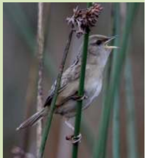
We had fantastic views of a family group of 5 endemic Apolinar's Wrens