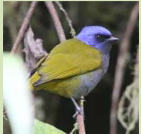
One of many Blue-capped Tanagers that were regularly seen, and when seen well like this one, are real stunners

This morning we set off early and drove to the start of the famous Galapagos Road. Our three 4x4 Jeeps were ready and waiting and we were soon on our way to our first stop in this superb area for Choco endemics. There were both Band-rumped and White-collared Swifts overhead but it seemed quiet in the forests. A short walk in the light rain soon found us some Golden Tanagers , Blue-winged Mountain-Tanager and Streaked Saltator , followed by Black-winged Saltator a showy Andean Solitaire . While trying to relocate the solitaire another bird was noted sat on the same branch, it was a fantastic Scaled Fruiteater and quite unexpected. We got fabulous views of a male which