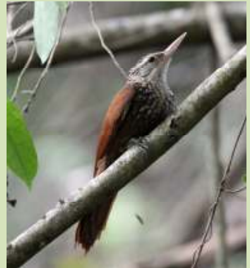
This was a very confiding Straight-billed Woodcreeper