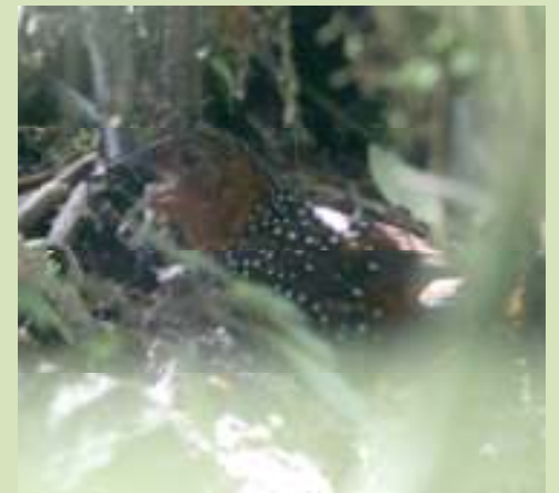
Not a great photo but gives you an idea of the amazing views we had of this pair of Ocellated Tapaculos