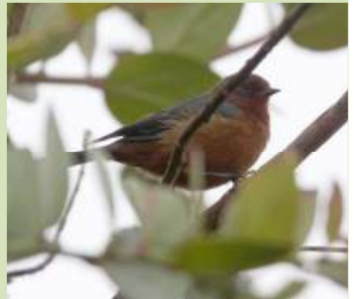
Rufous-browed Conebills another endemic proved a little elusive this year so we were glad to get this one