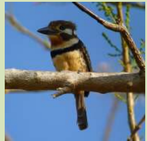
Several really showy Russet-throated Puffbirds were a great find on our last morning at Isle de Salamanca (Photo Gina Nichol)

Please note all photographs taken on tour by Steve Bird unless otherwise stated