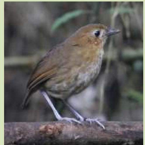
The endemic Brown-banded Antpitta once again gave us perfect views