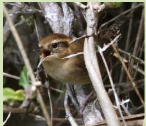
This particular Mountain Wren gave a good show at Yuntas. We only saw this species on 2 days during the tour