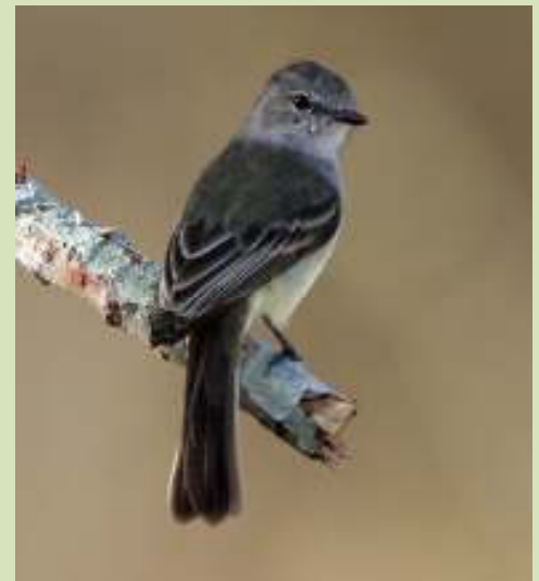
It's always good to see all the features on flycatchers as the books aren't always accurate. This Northern Scrub Flycatcher allowed super views