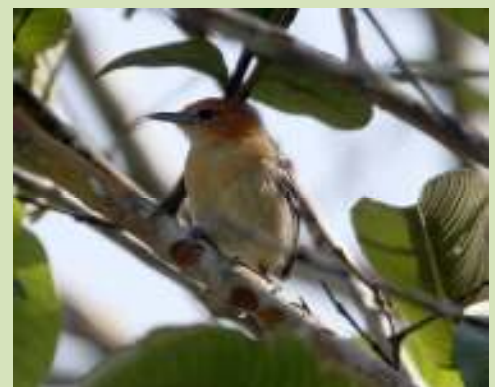
This is a female Pacific Antwren which showed better than the male that was also with it