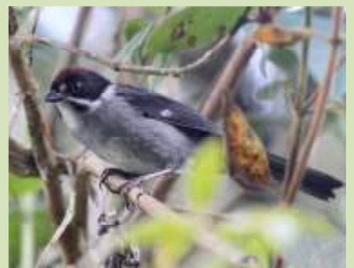
We encountered a few Slaty Brush-Finches during the tour, and often in mixed species flocks

An early start had us board our three 4x4 jeeps and set off up the bumpy road to Ventanas Peak. Reaching the top at dawn and accompanied by our good friend and local guide Jose we were soon looking for Blackish Tapaculo while breakfast was being prepared. The small black avian mouse duly obliged and back beside the vehicles we saw Speckle-faced Parrot and some distant Hooded Mountain Tanagers . There were lots of Masked Flowerpiercers around and a few White-sided Flowerpiercers as well as a Buff-breasted Mountain Tanager that was heard singing and eventually it was seen very well. The common hummer at these heights was Tourmaline Sunangel and we also noted several White-throated Tyrannulets , and once again in a distant tree we found several Lacrimose Mountain Tanagers and a male Masked Trogon . On a distant hilltop we spotted the Streak-throated Bush-Tyrant and close nearby was a Smoky Bush-Tyrant . In the undergrowth an Azara's Spinetail called, while a Red-crested Cotinga perched up on a very distant tree. And then a Black-billed Mountain-Toucan called and then appeared on a distant tree giving us great scope views. A group of Andean Siskins flew past but a real good find was a Barred Fruiteater trying its best to blend in with the surrounding leaves.