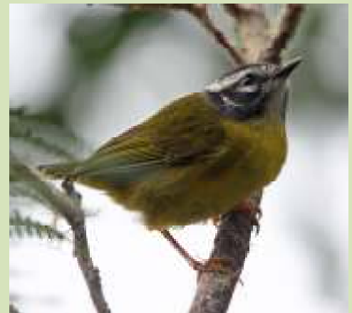
Another endemic this Santa Marta Warbler came so close we could have touched it