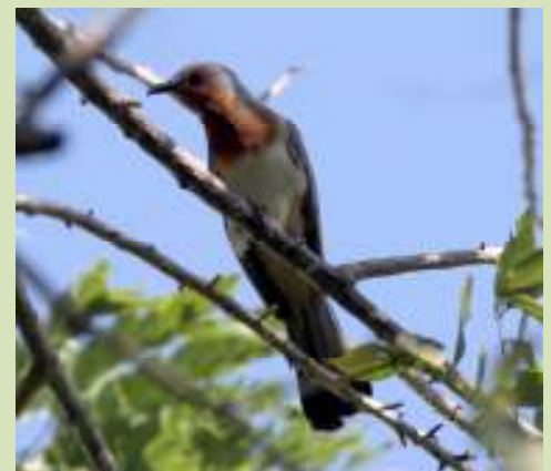
On one of our many successful roadside stops this Dwarf Cuckoo gave superb views