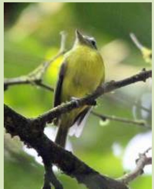
This very localised endemic Antioquia Bristle-Tyrant buzzed around our heads allowing great views!

This morning we had a very nice breakfast on the terrace of our hotel and then drove to the ridge at Victoria in time for sunrise. A fruiting tree close to where we parked became a hive of activity with Ochre-bellied Flycatcher , lots of Swainson's Thrushes , Red-crowned Woodpecker , a gorgeous male Yellow-tufted