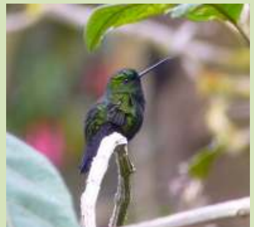
A really good hummingbird to see was this Black-thighed Puffleg. It is a near endemic, and near threatened species. This year Diego new a particular tree that this one was using as a regular perch. Local knowledge is great!