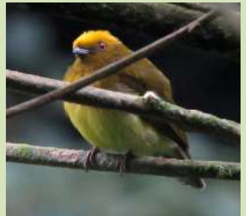
This Yellow-headed Manakin was one of the prized birds of the trip, seen by very few people we were privileged to get superb views because Diego new its regular perch