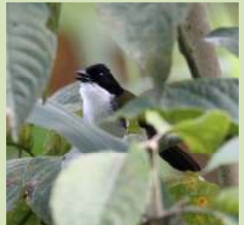
Another difficult bird we found 2 pairs of these Black-headed Brush-Finches