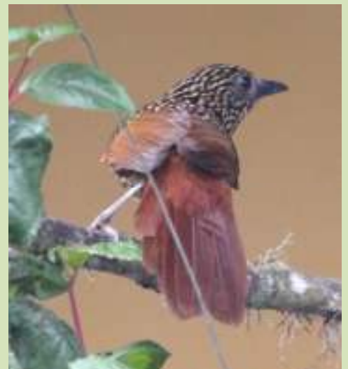
A pair of Flammulated Treehunters were exceptionally showy even investigating some hanging baskets