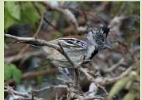
Black-crested Antshrikes were pretty easy to see in the dry coastal scrub