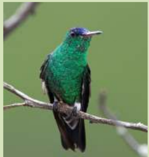
The real star at the Hummingbird Gardens is the endemic Indigo-capped Hummingbird and we must have seen at least 50