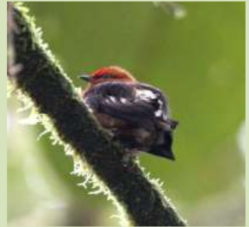
Having been inaccessible for a few years it was great that these Club-winged Manakins were now viewable from Galapagos road. We saw an incredible 10 species of Manakin