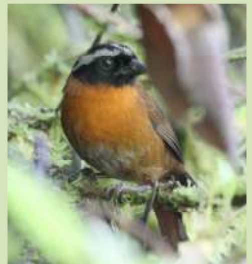
Always a great one to see as a lot of people miss it. We had this pair of Tanager Finches right in the open