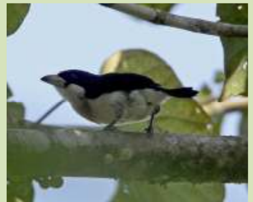
Yet another endemic we had several pairs of these White-mantled Barbets at a regular site only know to us!

This morning after breakfast we left for the nearby Cueva del Condor. In the parking area we saw Yellow-headed Caracara , Cinnamon Becard and a quick dash past by a Lesser Swallow-tailed Swift that was nesting nearby. As we made our way toward