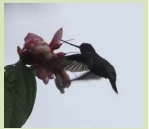
Given a little time this endemic Black Inca returned to the same set of flowers

Today we set off early and arrived at Yuntas at dawn where our breakfast was all prepared and ready at a tiny roadside restaurant. A great start to the day as we enjoyed our feast a Mottled Owl flew in and landed in a nearby tree allowing reasonable views in the poor dawn light. Nearby an Andean Motmot was seen perched in a tree before a hummingbird chased it off. After breakfast we started a slow walk along the road and near to a bridge across a river we found Yellow-throated Brush-Finch and on some low flowers a couple of Western Emeralds . On the stream was a Torrent Tyrannulet and then on a bank of