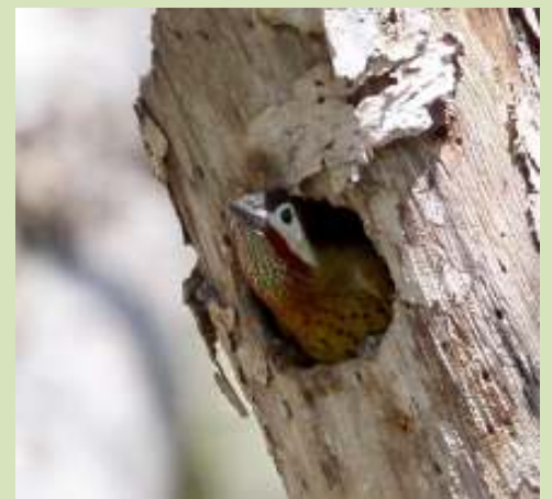
Our roadside stops were always good and this one produced this nesting Spot-breasted Woodpecker as well as Grayish Piculet (no photo)

We left Medellin early in order to get to our first stop for breakfast. Here we had a nice cooked breakfast accompanied by Thick-billed Euphonias , Swallow Tanager , Common Tody Flycatcher , Rusty-margined Flycatcher , Yellow-bellied Elaenia , a couple of Plain-coloured Tanagers , Black-billed Thrushes , Streaked Flycatcher , Buff-throated Saltator , Blue-necked Tanager , a Thick-billed Seed Finch and a Black-throated Mango on a nest. After breakfast we headed off to one of our sites that holds a good variety of specialties. Our walk began with another Black-throated Mango , a Pale-breasted Spinetail called and then we got really good views of Gray Seedeater and Ruddy-breasted Seedeater . A pair of Plain-coloured Tanagers appeared and then we found a male Green Thorntail feeding on a flowering tree. A Bay-breasted Warbler was found as well as several Rufous-tailed Hummingbirds , White-necked Jacobin and Sooty-headed Tyrannulet . A Mourning Warbler disappeared before anyone could get on it and then we scoped an endemic Beautiful Woodpecker on top of a dead tree. Moving on we came to a gully with a stream and here we got superb views of a pair of recently split Black-headed Brush-Finches . Further along our next endemic came in the form of two White-mantled Barbets that gave a great performance,