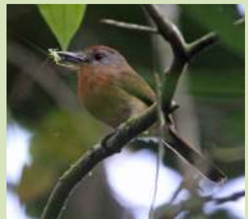
Gray-cheeked Nunlets can be hard to find but this pair gave fantastic views