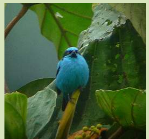
A real prize this endemic and localised Turquoise Dacnis showed well in its favourite tree