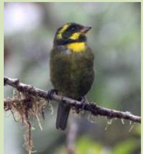
Another favourite and an endemic that is pretty easy to see on Galapagos road we had at least 10 on our first day there