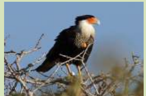
Northern Crested Caracara