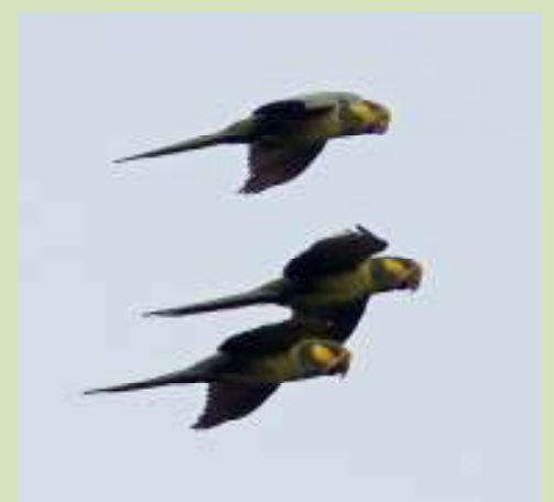
The Yellow-eared Parrot is often considered endemic, and we had stunning views of a flock of 16 of this rare and endangered species