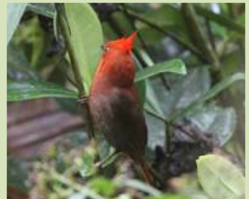
One of our target species for Galapagos road we had great views of a flock of 8 of these noisy and very attractive endemics