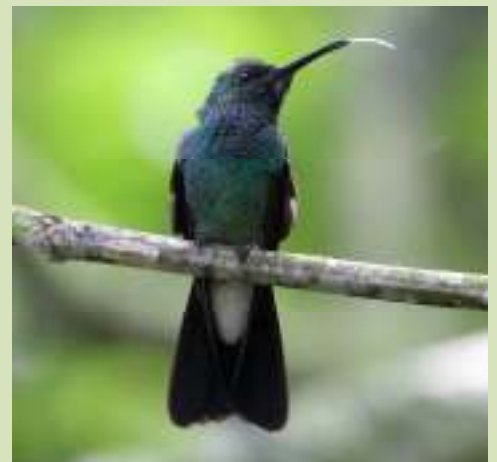
We saw lots of White-vented Plumeleteers during our tour, in fact we great views on no less than 7 days.

Our tour this year saw an amazing total of 62 species of hummingbird which included 8 endemics, 9 near endemics and 8 uncommon to rare