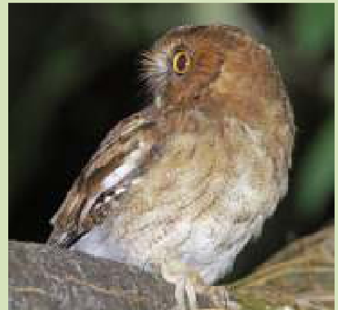
What a find! Santa Marta Screech-Owl. No playback it was spotted right beside the road at dawn and gave stunning close views

This morning after breakfast we spent an hour or so trying to see a few species around the gardens that we had so far missed. The usual hummingbirds were seen again and the Black-backed Thornbill put in a welcome appearance. Then we had a couple of Santa Marta Toucanets that showed well in a Cecropia tree beside the lodge, and the Black-fronted Wood-Quail performed on the compost heap. The awaited Blue-naped Chlorophonias then came to feed on the bananas and then to our joy we had excellent views of a male Lazuline Sabrewing . We then drove back up the mountain and began a slow walk down. We first encountered a gang of White-throated Tyrannulets and some Blue-and-White Swallows . An endemic Rusty-capped Spinetail called and eventually showed itself, a while further down a Plain-breasted Hawk drifted past and a Black-throated Tody-Flycatcher gave superb views. A small mixed flock contained Santa Marta Mountain-Tanager , Yellow-crowned Redstart , Santa Marta Brush-Finch and at last we got excellent views of an endemic Brown-rumped Tapaculo . Beside an overlook offering fantastic views down to Santa Marta we saw White-collared Swifts and a White-