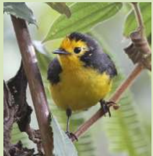
Golden-fronted Redstarts were easily seen at many localities. This was the race chrysops and we also saw the white-faced race ornatus