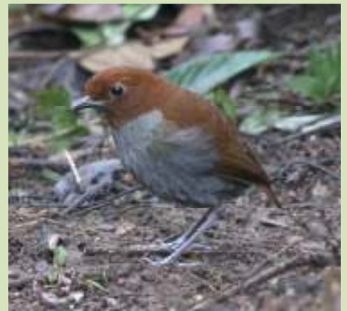
Endemic and normally really hard to get a good view of, this Bicolored Antpitta eventually came out

This morning we set off to Los Nevados National Park. Arriving at dawn we set up breakfast and waited for it to get brighter and indeed warmer. Our first birds of the day were Scarlet-bellied Mountain Tanagers and several Veridian Metaltails . A Pale-naped Brush-Finch was scoped singing on a tree top and then we got views of Black Flowerpiercer while alongside us a