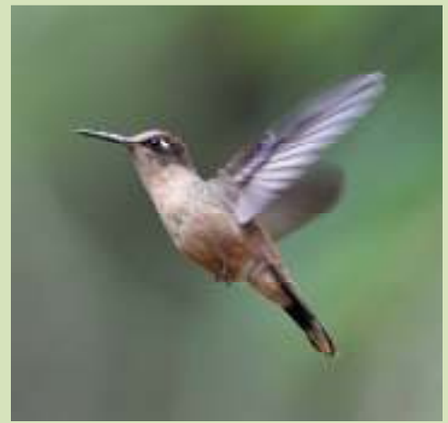
Everyone wanted to see the endemic Blossomcrown and we were not to be disappointed with some superb views