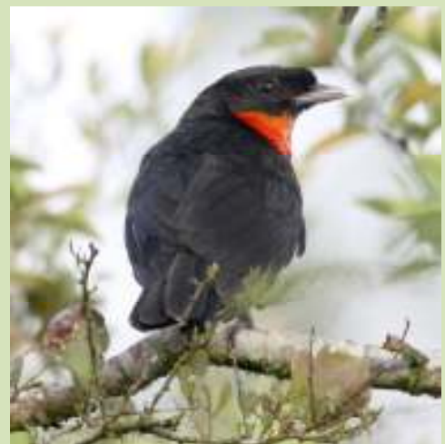
We had great close looks at many Red-ruffed Fruitcrows