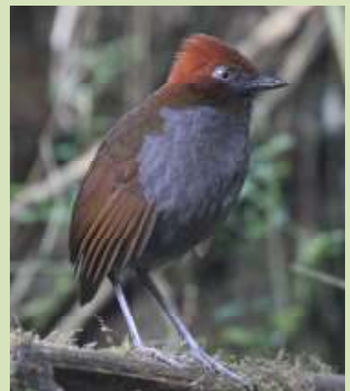
Not always an easy one to see this year the Chestnut-naped Antpitta almost stole the show