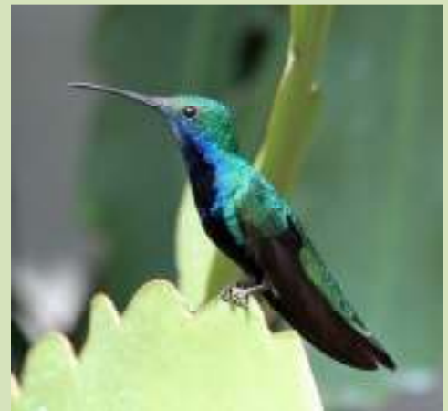
Male Black-throated Mangos such as this one were easy to see at the Hummingbird Gardens