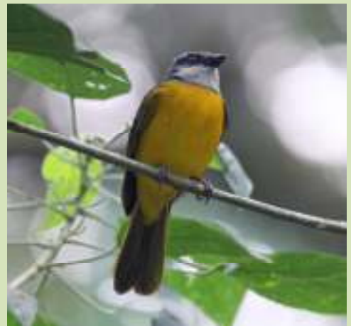
This Gray-headed Tanager was extremely confiding coming in close and posing for us!

Our last morning of the main tour had us visit lake Tabacal where we arrived to a delicious breakfast. Nearby a Rosy Thrush-Tanager called but never showed itself. Birds that did show included Tennessee Warbler , Thick-billed Euphonia , Saffron Finch , Golden-faced Tyrannulet , Rusty-margined Flycatcher , and then an antbird which turned out to be a male Jet Antbird and the first ever confirmed record from this area. We then entered the gardens and were soon confronted by an elusive yet vocal White-bellied Antbird . We struggled at first but eventually got superb views of this bird. Nearby a White-throated Spadebill called and we also got great views of this. Next up was White-bearded Manakin , Plain Antvireo , and a Rusty-breasted Antpitta that called and was only really seen by Dave. An American Redstart was much easier and in the forest we had a difficult time getting views of two Colombian Wrens