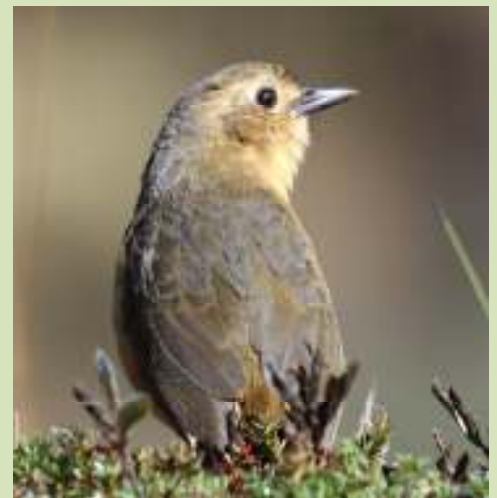
This Tawny Antpitta came so close that it was calling almost at the feet of some of our group