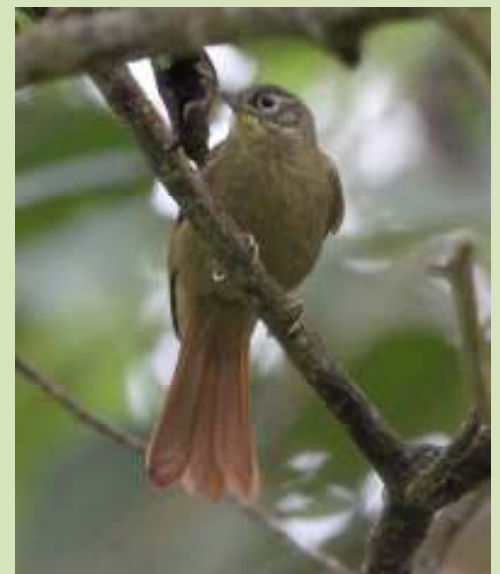
His Montane Foliage-Gleaner showed well and was of the first of many we saw on 7 days of the tour