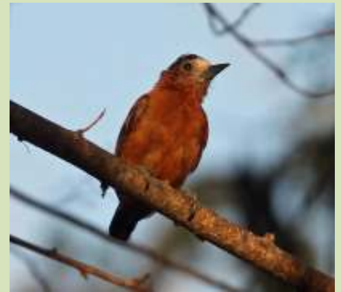
We had fabulous views of this pair of Chestnut Piculets