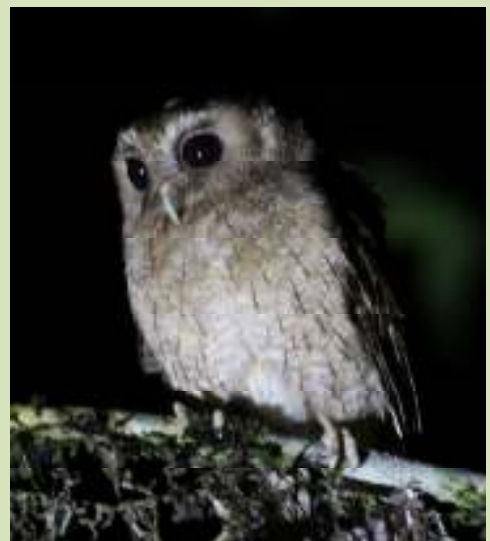
One of the highlights of the trip was this very showy and rarely seen Colombian Screech-Owl