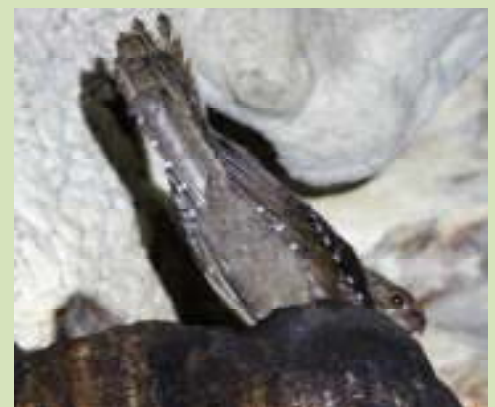
We had nice views of the Oilbirds just inside the entrance to their cave. Its not pitch black so a torch light used properly does not disturb them.