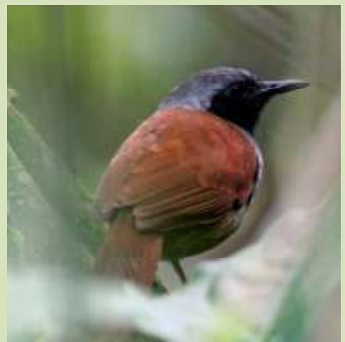
This White-bellied Antbird proved very difficult to see, but eventually it gave itself up and allowed good views

This morning we met up early and were joined by Jim who was just doing the Santa Marta section. Our three 4x4 Landcruisers awaited us and once we were packed into them we set off towards the fabled Santa Marta mountains. Our first roadside stop on the way up at dawn produced Pale-breasted Thrush , good views of Rufous-capped Warbler , and then a pair of Rufous-and-white Wrens and Barred Antshrike . Further up at an overlook we had a good selection of species including Swallow Tanagers , White-lined Tanagers , Blue Dacnis , Yellow-crowned and brief Venezuelan Tyrannulet , Golden-fronted Greenlet and good views of the very attractive Golden-winged Sparrow . We also got pretty good looks at the endemic Santa Marta Foliage-Gleaner . Streak-headed Woodcreeper appeared, we then found a group of Rose-breasted Grosbeaks , Lesser Goldfinch , several close Black-chested Jays , a Lineated Woodpecker , Tennessee Warbler , Red-eyed Vireo and several Steely-vented Hummingbirds . A couple of Keel-billed Toucans were scoped, a Broad-winged Hawk was seen