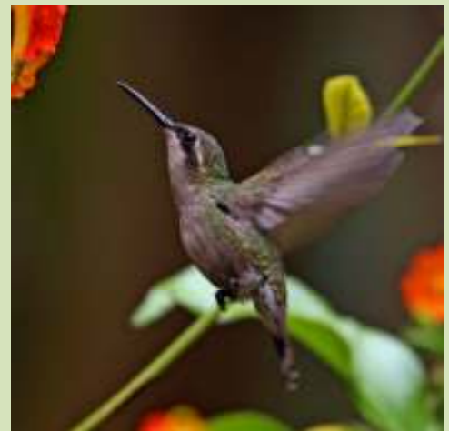
The endemic Santa Marta Woodstar proved difficult to see this year but our fortune was in when this female came to a bunch of flowering bushes