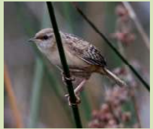
Another photo of one of the family of Apolinar's Wrens that gave some of our best views ever