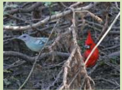
Two great birds in one view the Glaucous Tanager and stunning Vermilion Cardinal both came to drink at a small pool as we quietly waited