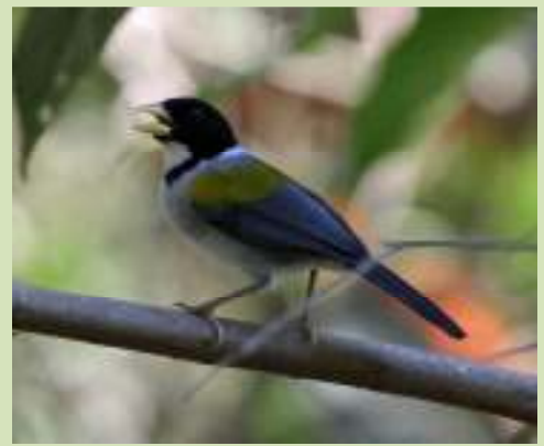
The Golden-winged Sparrow was again easily found near to Minca and we enjoyed these fantastic views of this very smart bird

First thing after breakfast we headed downhill from Minca to an area for our first target species of the day. A short walk soon had us watching a pair of Black-backed Antshrikes and a few minutes after enjoying these birds we were watching a superb male Lance-tailed Manakin . We then drove back up past Minca and made a brief stop where we watched a couple of Gartered Trogons , a Pale-eyed Pygmy-Tyrant , Southern Beardless Tyrannulet , Thick-billed Euphonia , American Redstart and a fine view of a Whooping Motmot . Moving on we saw a bit of activity beside the road so quickly got out and found a few birds flitting around. Then by whistling Ferruginous Pygmy-Owl things picked up and birds started to fill the trees around us. A real Ferruginous Pygmy-Owl came in and added credence to the show which held a cast that included Dusky-capped Flycatcher , Swallow Tanagers , Streaked and Buff-throated Saltators , several Red-billed Emeralds that showed well, Rose-breasted Grosbeak , and in the tangles were Rufous-breasted Wren and Long-billed Gnatwren , while some of the group got onto a Connecticut Warbler . Moving on again we took a side trail where we found a very showy Yellow-legged Thrush , White-lored Warbler , and Montane Foliage-Gleaner . With a couple of people missing Santa Marta Tapaculo yesterday we had an ideal spot and a cunning idea which worked perfectly and allowed