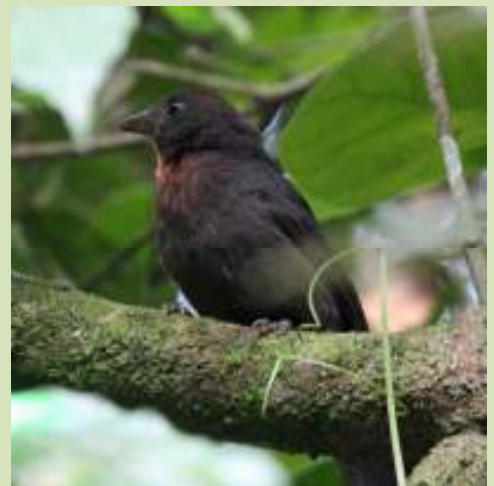
One of the key endemics at Victoria is the Sooty Ant-Tanager and this is one of a group we found there