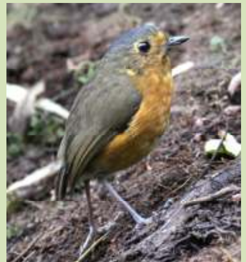
Well, all the antpittas in Ecuador seem to have names so we have christened this Slate-crowned as 'Little Jimmy'