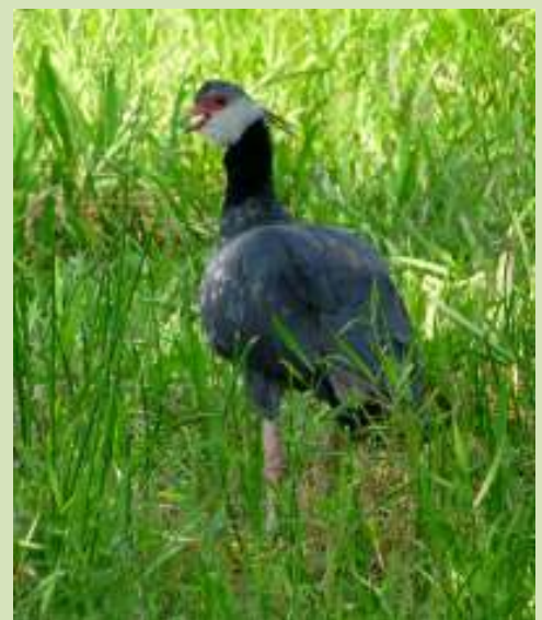
A superb find by Kev from the bus and an hour before the site where we were to look for this species, this Northern Screamer was a welcome addition to our list and gave super views.