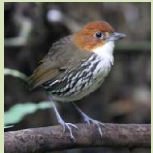
Out of the 10 species of Antpitta seen we had fantastic views of most including this Chestnut-crowned