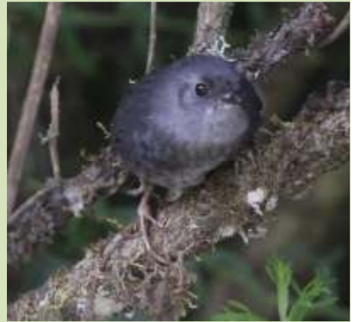
Tapaculos are nearly always difficult to see so we were really pleased with this showy endemic Mattoral Tapaculo