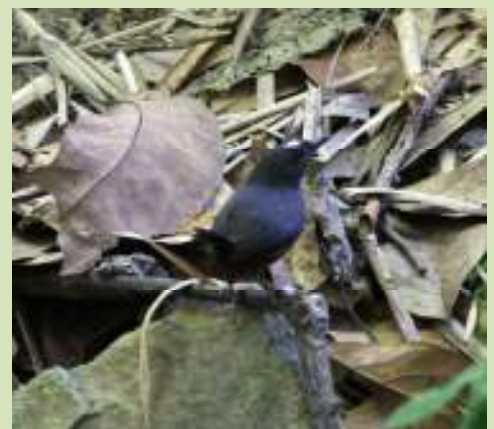
Not such a great photo but our views were simply stunning of this endemic Santa Marta Tapaculo. How often do Tapaculos come right out in the open and show like this!