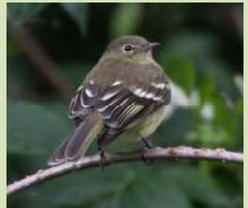
This Mountain Elaenia showed well at the end of our very first day of birding in Colombia