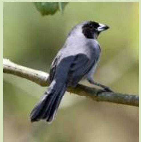
We had unbelievable views of this Black-faced Tanager and it was the only one we saw