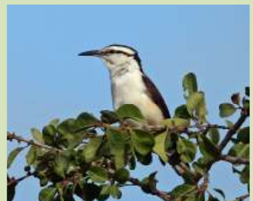
We were entertained by a pair of showy Bicolored Wrens just after our breakfast at Los Flamencos National Park