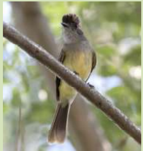
This endemic Apical Flycatcher was one of a pair that gave wonderful views on a roadside stop