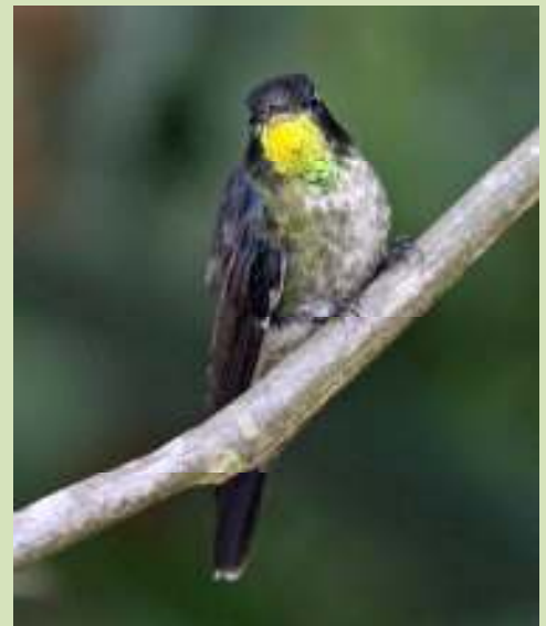
This male Black-backed Thornbill is one of the most difficult hummers to see. An endemic as well we were very happy to get fantastic close views